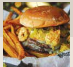
1/2 lb Double Hell in the Pacific